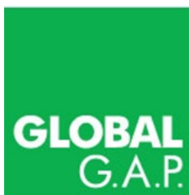
Figure 1 GlobalG.A.P. logo

GlobalG.A.P. is a must. Although it is not mandatory, Europe's consumers and importers want quality and transparent proof of origin. For this reason, GlobalG.A.P. certification - one of the most important European standards for sustainable production and high food safety - is a must for exporters of fresh fruit and vegetables. GLOBALG.A.P is a pre-farm-gate standard, which means that the certificate covers the process from farm inputs like feed or seedlings and all the farming activities until the product leaves the farm. GLOBALG.A.P includes annual inspections of the producers and additional unannounced inspections by independent accredited certification bodies. Steps to take in order to get certified: https://www.globalgap.org/uk_en/what-we-do/globalg.a.p.-certification/five-steps-to-get-certified/index.html