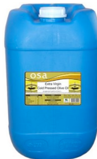
Figure 11