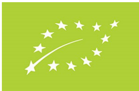
Figure 3 EU Organic logo