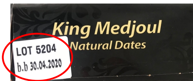
Figure 7 Medjoul Dates Israel, labelling examples France