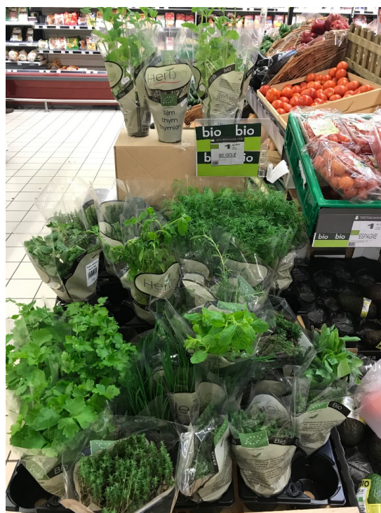
Figure 18 Retail Packaging Example BIO Fresh Herbs in pots France