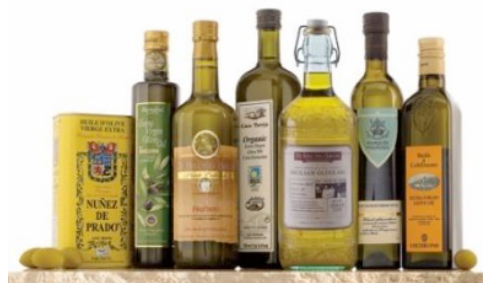
Figure 13