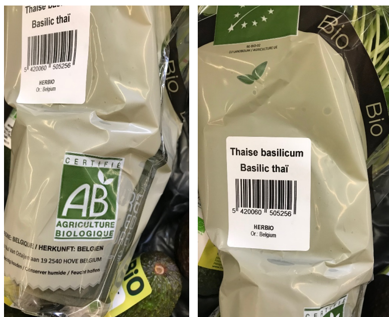
Figure 10 Example Labelling Biological Fresh Herbs France