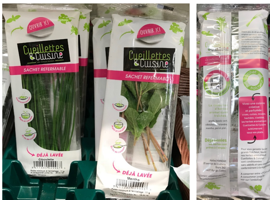
Figure 9 Example of Labelling Fresh Herbs France