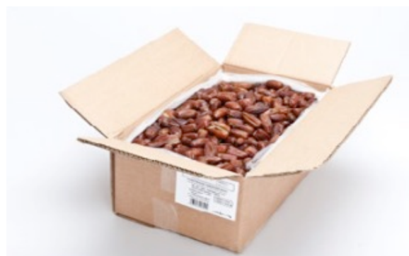
Figure 14 Example Bulk Packaging Dates: Pitted Dates in Cardboard Box with Plastic lining (10kg).

The type of packaging demanded by the supermarkets has seen a trend in recent years. In the old days the dates were usually packed in styrofoam shells, today wood pulp punnets are preferred. They are better suited to the natural aesthetics of the product. There is also an increase in demand for so-called DOY packs (sealed plastic bag that is designed to stand upright). The most popular packaging size