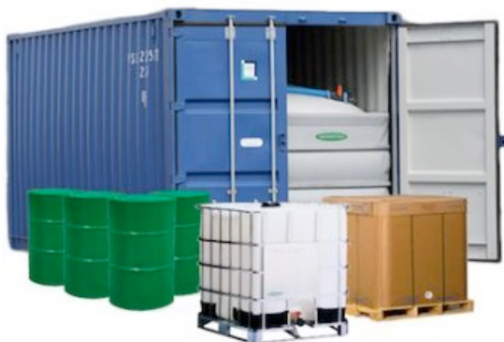
Figure 12