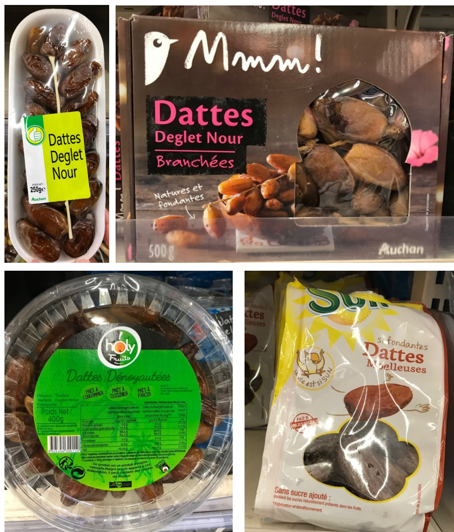
Figure 15 Miscellaneous Examples Retail Packaging Dates France