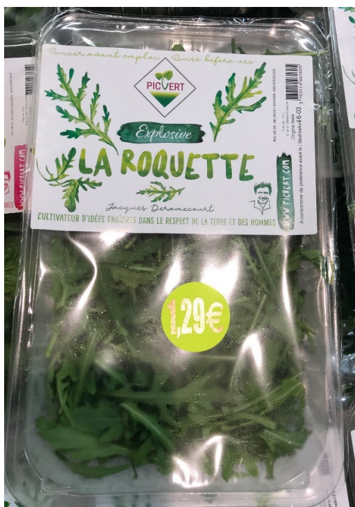
Figure 17 Retail Packaging rocolla in France