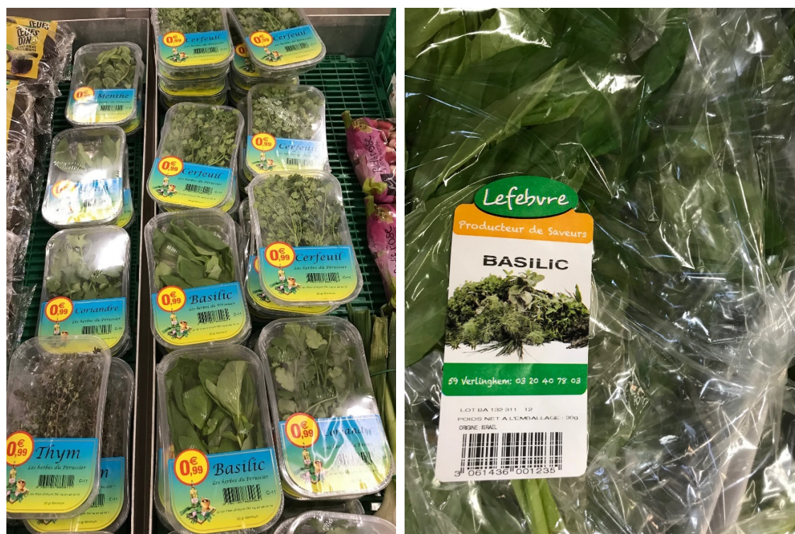
Figure 16 Retail Packaging Example Fresh Herbs France